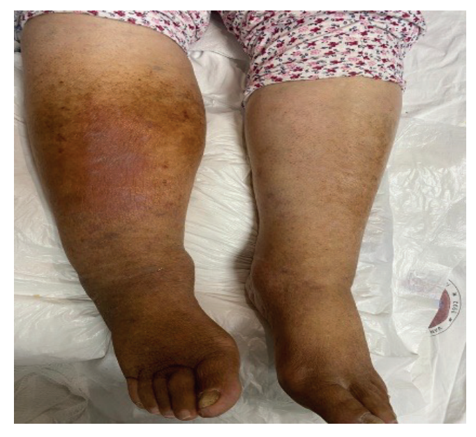
Figure 1. The patient with cellulitis in the right leg was hospitalized

On breast ultrasonography (USG), the left breast skin was subcutaneously thickened and linear fluid loculations were observed between the left breast fat lobules. No solid mass that could cause