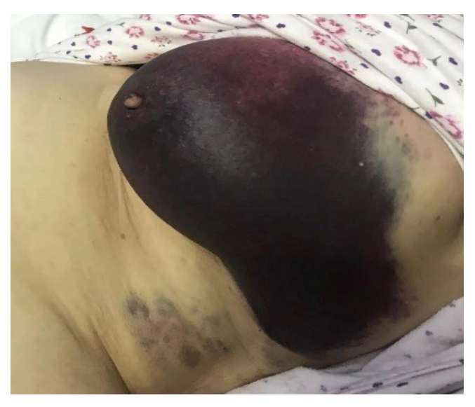
Figure 2. Left breast hematoma. The appearance of the patient at first examination