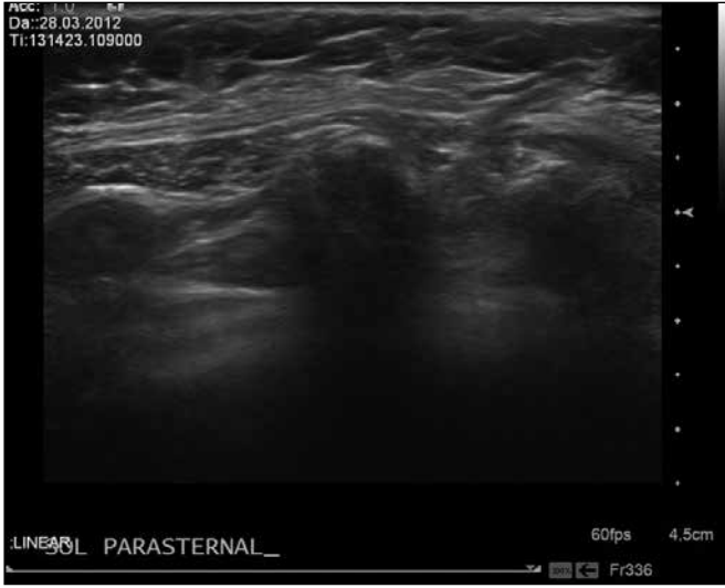
Figure 4. The sternal muscle seen in the longitudinal plane.

the chest in 1.387 adult patients (10). The sternalis muscle is usually seen as a small, asymmetric opacity at the medial posterior edge of the breast on mammogram CC views and can simulate breast pathology (11, 12). The muscle is isodense with fibroglandular densities and can be seen with varying diameters, shapes and contours on mammograms (13). The obtuse angle at the chest wall is typical of a muscular structure, and it is usually surrounded by fat (14). Significantly, it could not be detected in all follow-up images, and may appear larger or smaller on follow-up mammograms due to the distinct pulling of the breast during positioning. When a density suggesting the sternalis muscle is seen on a mammogram, it should be investigated with US like all other asymmetric opacities and mass-like densities with irregular or spiculated margins.