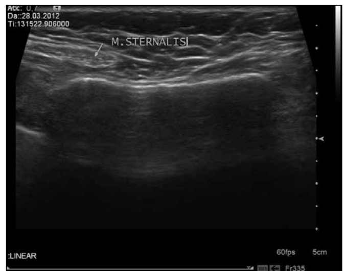
Figure 3. More inferior view of figure 2.

fibres arise from the sheath of the rectus abdominis muscle or adjacent structures and terminate upon the pectoralis fascia, upper sternum, costal cartilages, the sternum, or the medial heads of the sternocleidomastoid muscle (7, 8). The sternalis muscle can be either a few short fibres or a well-formed muscle, and may be unilateral or bilateral (7, 9). This variant was seen unilaterally and in the right breast in our case. When deep parts of the breast are visualized and high-quality images are obtained, the sternalis muscle may be seen in CC projections. It was first shown on mammography by Bradley et al. (5), who described it in six women. Four of those women were seen during screening and diagnostic mammographic imaging of 32.000 women (0.01%). Different anatomical studies have reported the prevalence of the sternalis muscle to be 1,9–23,5% (4). Its incidence was described as 6.2% in a study that examined multidetector computed tomography (CT) scans of